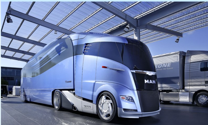
The MAN and Krone ConceptS presented at the IAA 2012 is thought for long distance and could have the aerodynamic resistance of a regular car.

The Parliament's vote on the new Weights and Dimensions Directive means that incoming MEPs have a base text to work off following the European elections. The proposed revision of the rules is aimed at improving the safety, economic and environmental performance of heavy-duty vehicles. An adaptation to technical progress of the type-approval requirements on their masses and dimensions within the framework of existing Regulation will also accompany the new legislation.