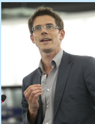
Rapporteur of the new F-Gas Regulation, MEP Bas Eickhout

On 14th April the EU Council adopted the consolidated text of the new F-Gas Regulation, which will see a phase-down of the use of f-gases in heating and cooling equipment over the next five years.