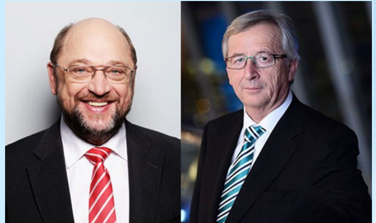
S&D and EPP candidates Martin Schultz and Jean-Claude Juncker ( left to right ), who are the two top candidates for President of the next European Commission. But will one of them really get the job?

The other focal point of political debate is the imminent election of the new President of the European Commission. For the first time in history, the political parties which ran in the European Parliament elections are trying to impose their champion as head of the Commission. This means that German socialist Martin Shultz and Luxemburgish center-right Jean-Claude Juncker are on the shortlist. However, we take the bet that the ultimate victor will be an outsider, who will win the position in a last minute deal between the Parliament and the Member States.